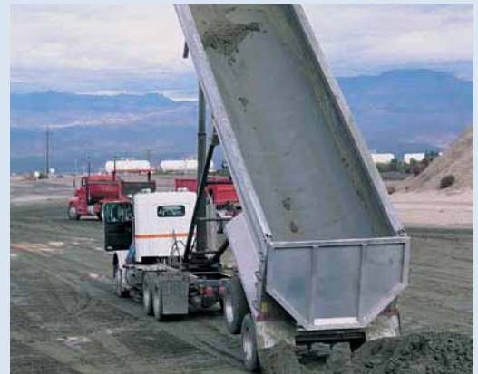
Quicksilver liners are proven performers with the toughest loads.

Call Aero For All The Answers. We make it easy to get the dump liner that’s right for your needs. Just contact your Aero dealer or an expert Aero customer service technician at 1-800-535-9545. They’re trained to handle all your ordering, installation, and application questions. Call today!