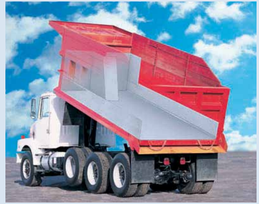
Bulkhead and hoist pedestal optional.

Aero Industries is also the national distributor for DURAPRO™ dump body liners - a reprocessed heavy duty dump liner.